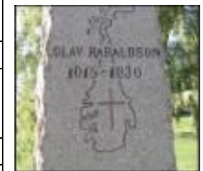
Stone from Hundrop- Dale Gudbrand Farm