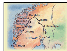
2016 Tour Route