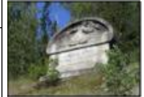
Prillar Guri Monument Kringen, Sel, Norway