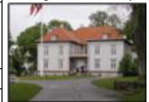
Eidvoll, where the constitution was signed