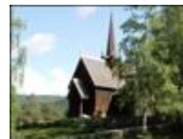
Garmo Stave Church at Maihaugen