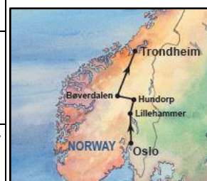
2023 Tour Route