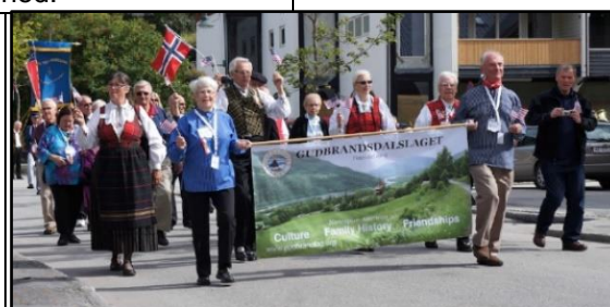
Kringen Parade & lag members carrying our new lag banner