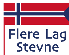
New Stevne Logo