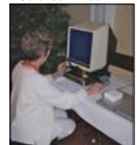
Microfiche machine used by many in lab Historical Display