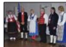
Bunads on Parade at 2006 Eau Claire Stevne