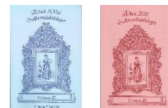
Årboks, Vol 25 & 26