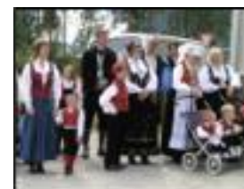
Bunads on Parade at 2005 Ringebu Festival